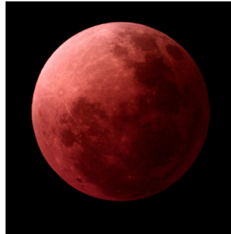
Verde Valley Total Lunar Eclipse April 15th, 2014

Membership is open to anyone that has an interest in or a desire to learn more about astronomy. Family membership dues are $15.00 per year. Membership entitles the member and their family to attend special club events, dark sky observing sessions, star parties and any other special activities sponsored by the club.