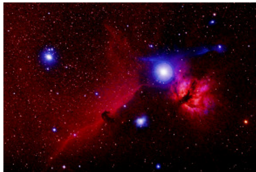
NGC2024 — Flame Nebula IC434—Horse Head Nebula

Be sure to follow our special events like the Messier Marathon, Tuzigoot Star Night, Night Under the Stars at Alamo Lake & Star Night at Kartchner Caverns.