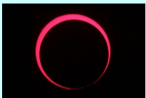
Annular Solar Eclipse from Page, AZ 2012

Astronomers of Verde Valley is an amateur astronomy club that serves the communities of the Verde Valley, Arizona. Here, surrounded by the Minus Mountains and the Red Rock country of Sedona, we are favored by the clear air and dark skies of the high desert. We have an enthusiastic and varied membership that includes scientists, professional astronomers, teachers, authors, students, and big-city refugees from all walks of life. Our mission is to inform, educate and entertain by providing a varied and interesting program of activities for our membership and the communities we serve. Our projects include educational programs and presentations by guest speakers and our members, practical telescope design and construction, public star parties, field observation of various astronomical events and trips to observatories and other space science venues.